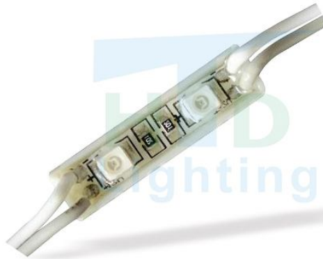
*HTD-26072 LED MODULE