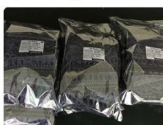
Anti-static bag package